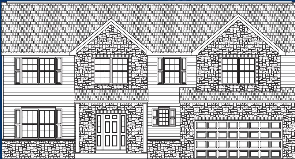
Elevation as Shown; The Premier