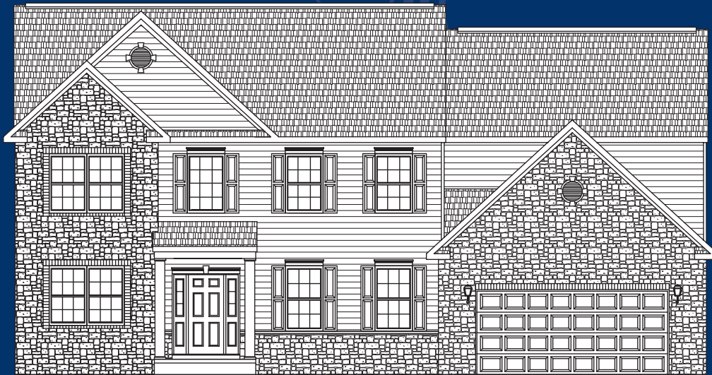
Elevation as Shown; The Premier