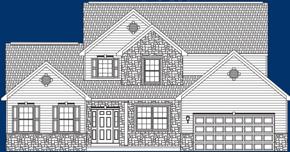
ELEVATION AS SHOWN; THE PREMIER